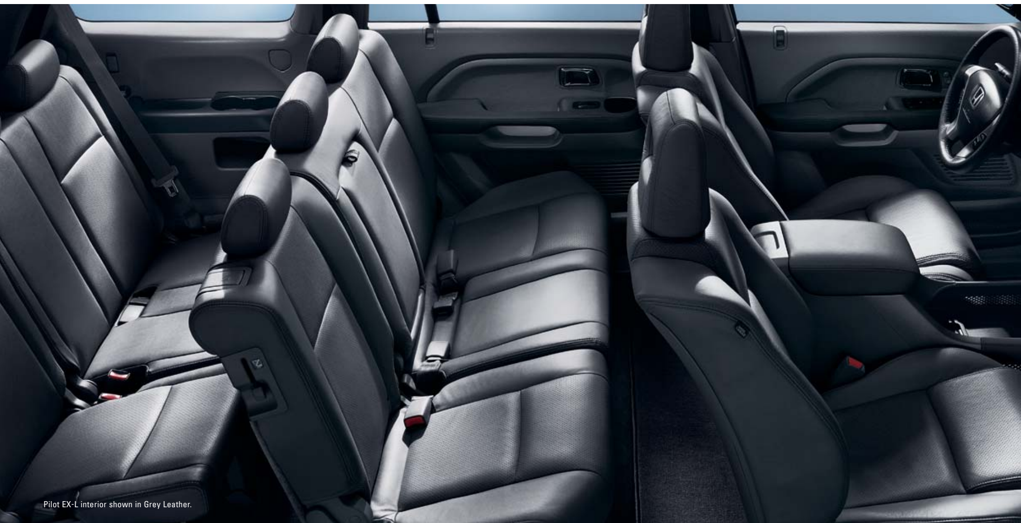
Pilot EX-L interior shown in Grey Leather.