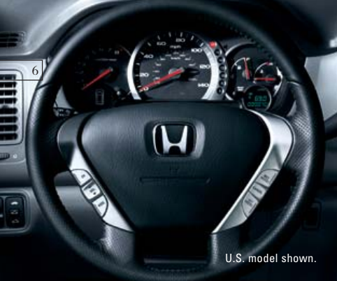
U.S. model shown.