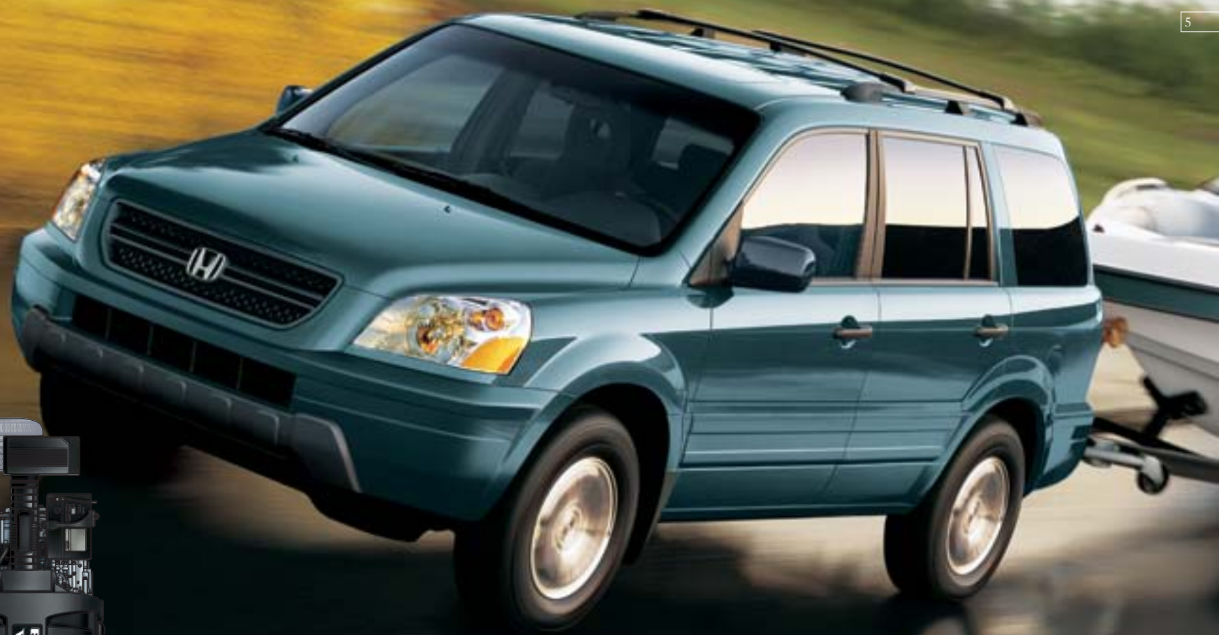
Pilot EX-L shown in Steel Blue Metallic with accessory crossbars and towing package.

*Towing requires installation of a power steering and transmission fluid cooler, both available exclusively from your Honda Dealer. Maximum towing capacity is 2,045 kgs for boat trailers and 1,591 kgs for all other trailers. Premium unleaded fuel is recommended when towing above 1,591 kgs. Refer to the Owner's Manual for additional towing information.