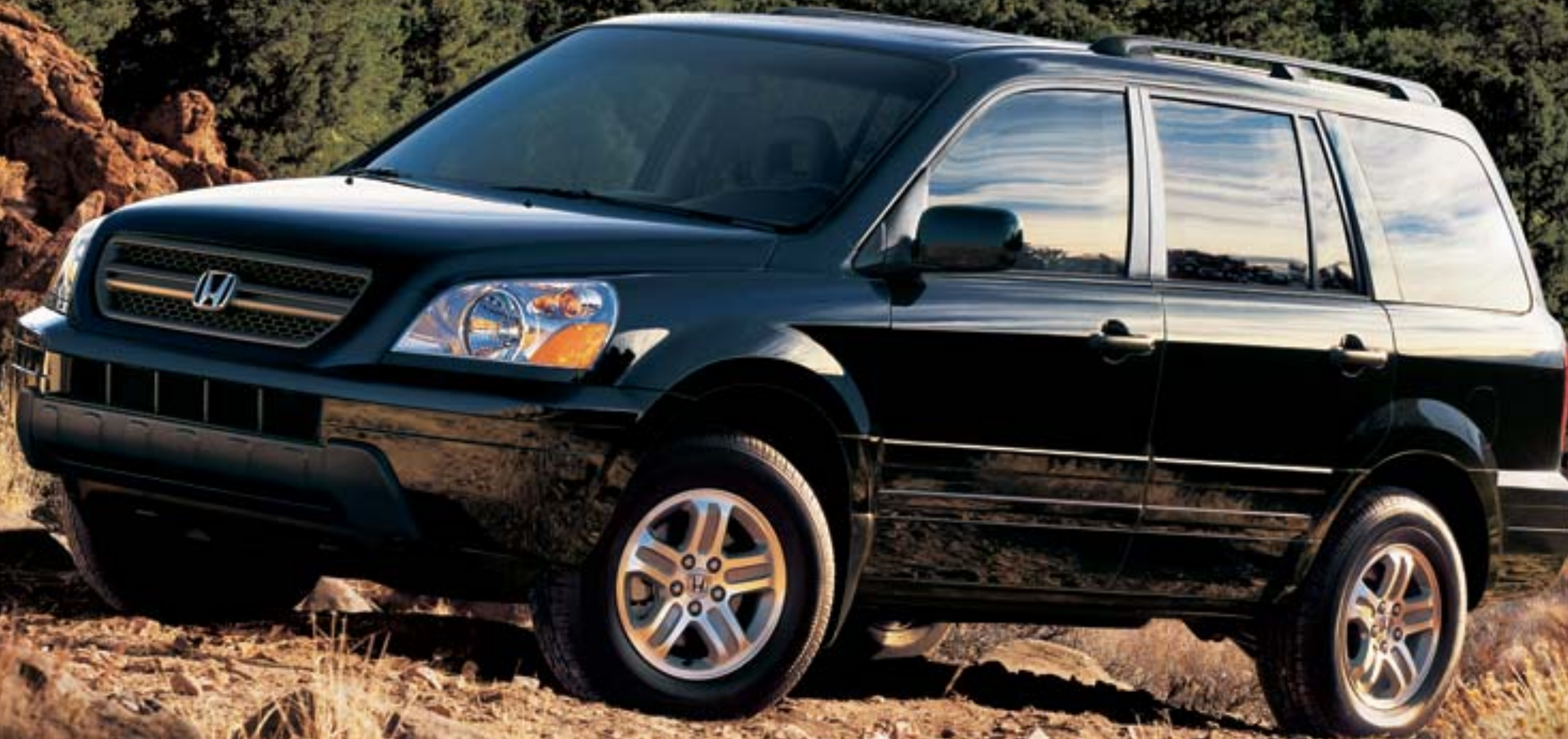
Pilot EX-L shown in Nighthawk Black Pearl.

One look at the Pilot and right away you get the idea it was built to please a tough crowd. Its muscular flanks and wide stance give it a commanding presence that echoes big capabilities, both on- and off-road. Pilot gives you beefy tires and roof rails, and for those seeking to heighten their outdoor experience, all EX-L models come with a power moonroof. Let your gaze linger, and see how the clean lines of the Pilot also hint at its quiet and comfortable nature at highway speeds. It's a shape that's more classic than trendy and that delivers as much in the way of function as form. After all, every Honda is built to last – and rugged good looks never go out of style.