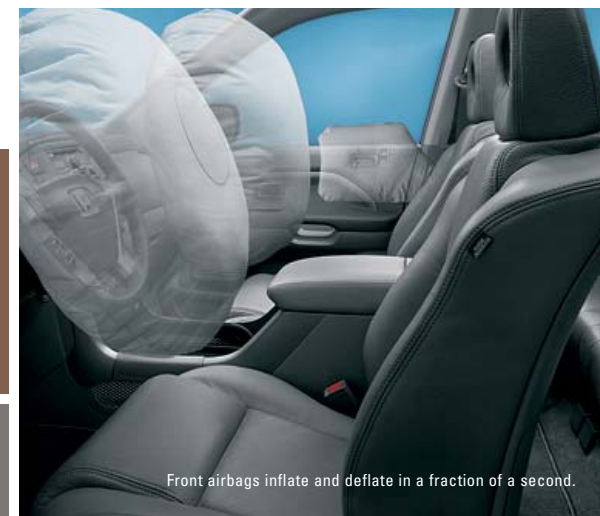
Front airbags inflate and deflate in a fraction of a second.

All Pilot models come equipped with the Lower Anchors and Tethers for Children (LATCH) system. This system makes it easier to install compatible child seats in the second row.