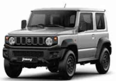
Single-tone Silky Silver Metallic (Z2S)