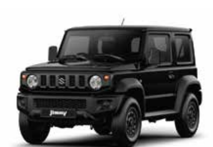
ngle-tone Bluish Black Pearl 3 (ZJ3)