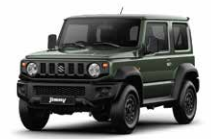
Single-tone Jungle Green (ZZC)