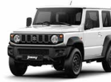
Single-tone colours Superior White (26U)