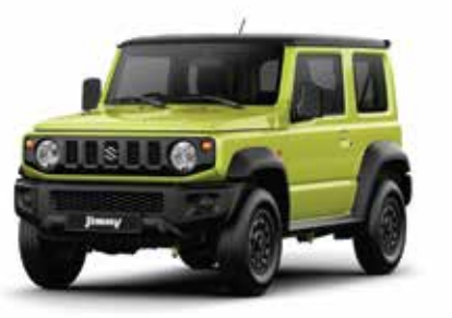
Wo-tone Kinetic Yellow + Bluish Black Pearl 3 (DGS