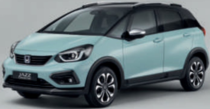
SURF BLUE / TWO-TONE