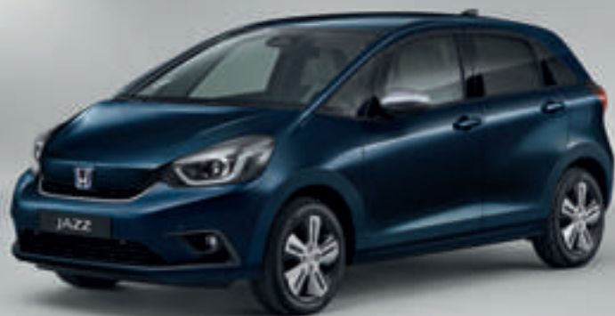
MIDNIGHT BLUE BEAM METALLIC