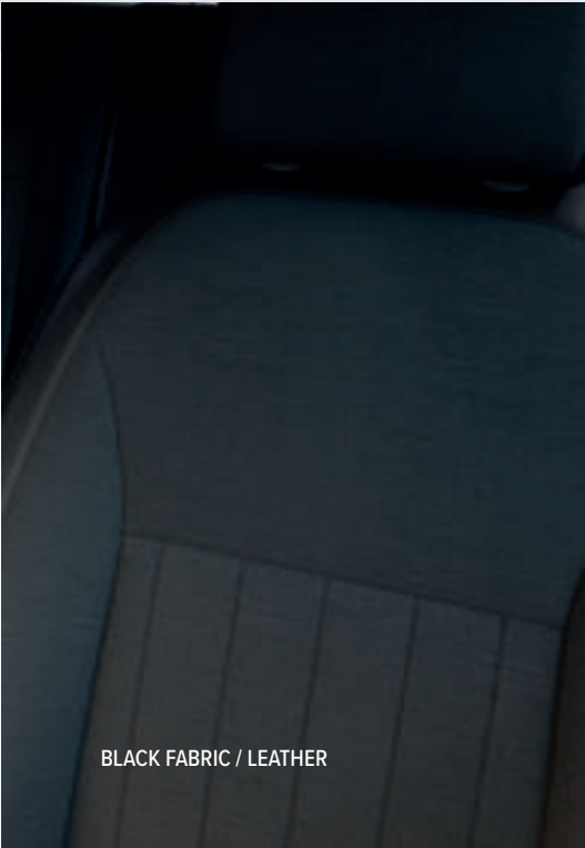
BLACK FABRIC / LEATHER