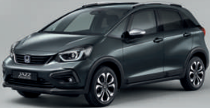
SHINING GRAY METALLIC