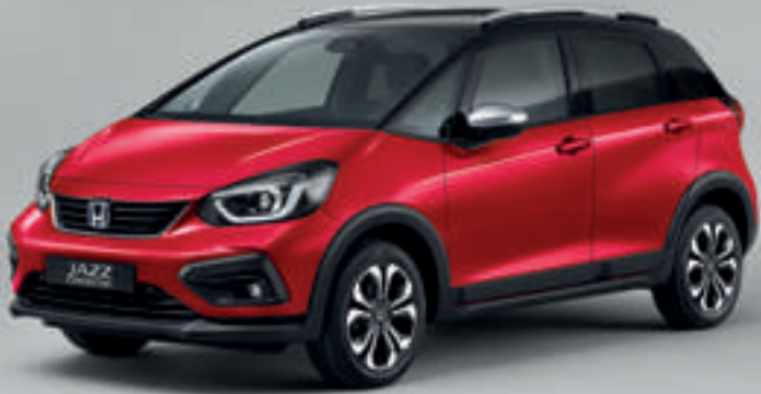
PREMIUM CRYSTAL RED METALLIC / TWO-TONE