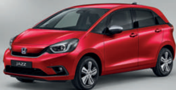
PREMIUM CRYSTAL RED METALLIC