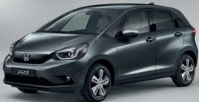
SHINING GRAY METALLIC