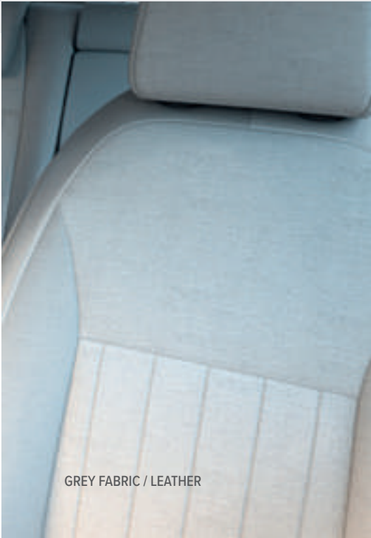
GREY FABRIC / LEATHER