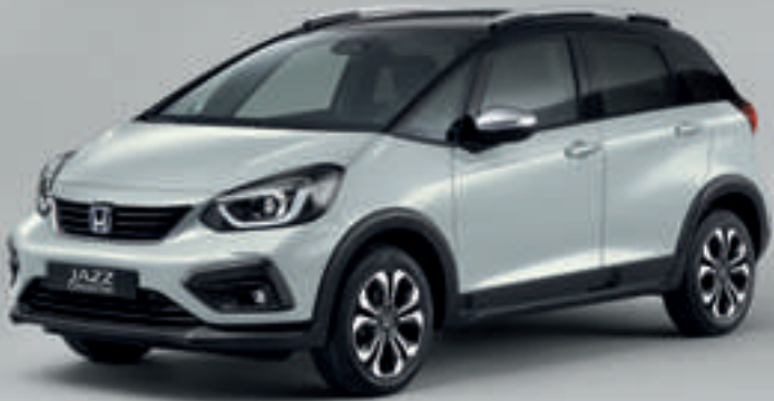
PREMIUM SUNLIGHT WHITE PEARL / TWO-TONE