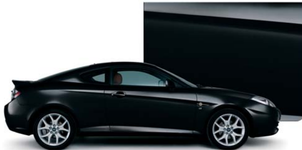
Stone Black (Mica)