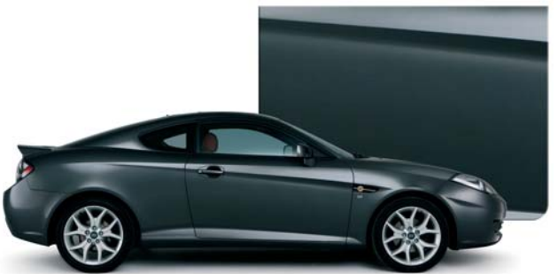
Steel Grey (Metallic)