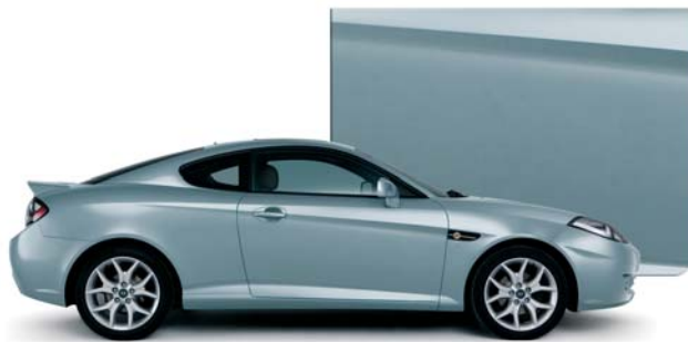
Sky Blue (Metallic)