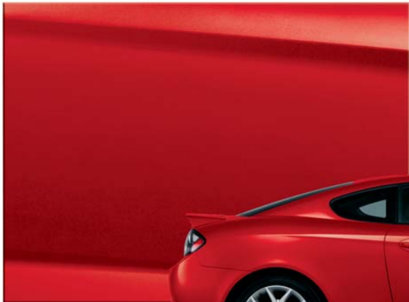
Shine Red (Solid)

Whether you pick a solid, metallic or mica finish, your car will stand out on the road and say something about you.