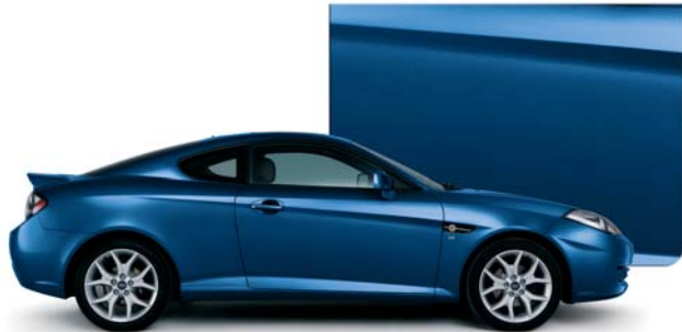
Vivid Blue (Metallic)