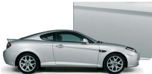
Continental Silver (Metallic)