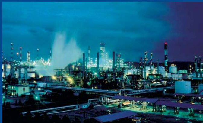
Hyundai factory – Korea